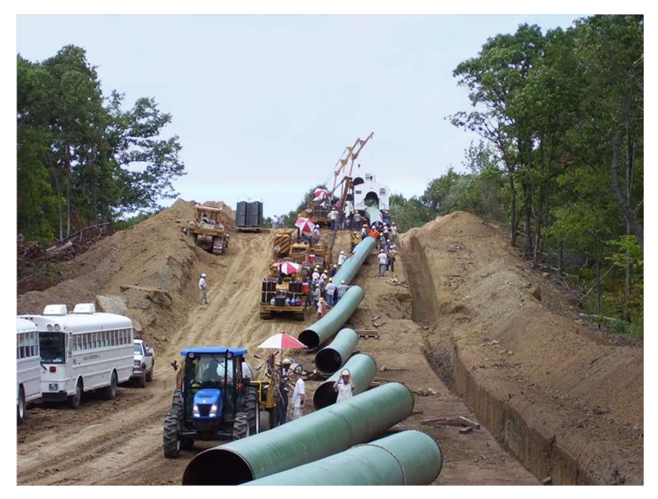
Figure 2: Photo of construction of a representative 42-inch pipeline in a 125-foot wide easement.