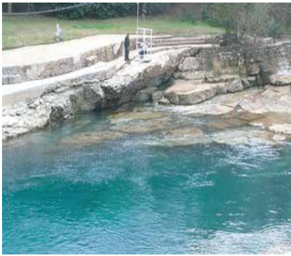
Barton Springs Discharge

(cubic feet per second) Previous value: 70 cfs on 03/10/22