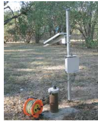
Lovelady Well Water Level Elevation (feet above mean sea level) Previous value: 490 ft-msl on 11/18/21