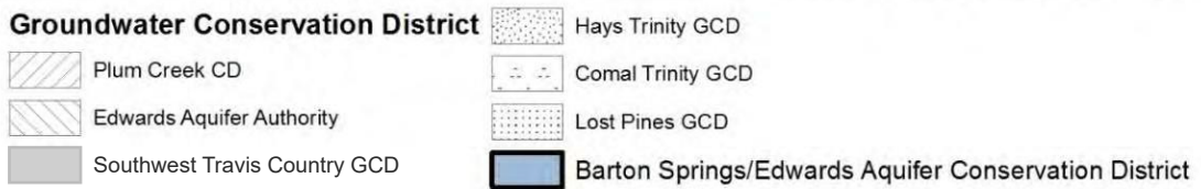
Figure 1 - The District's territory including the expanded Shared Territory and the adjacent Groundwater Conservation Districts and their respective jurisdiction over aquifers.